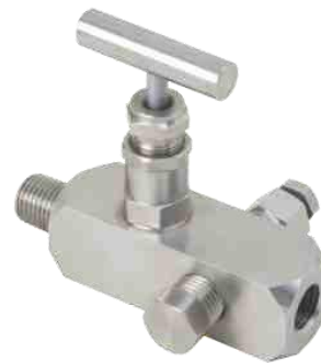
MULTI PORT NEEDLE VALVE , SSKE34-2